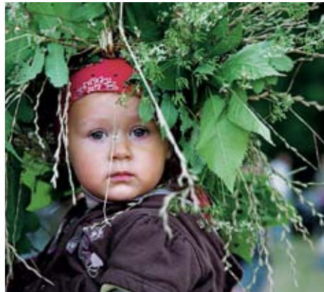
St. John's festivities in Plateliai, Žemaitija