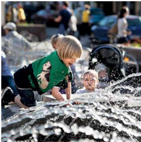
On Town Hall and Cathedral squares