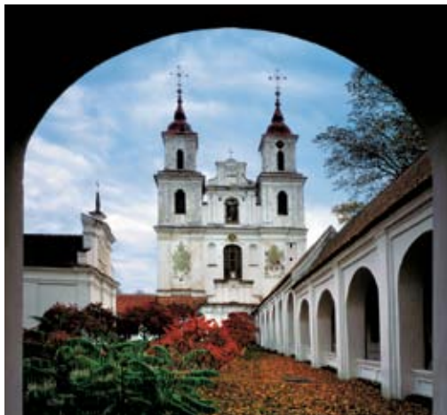
Tytuvėnai, Church of the Blessed Virgin Mary Queen of Angels, and Bernardine monastery